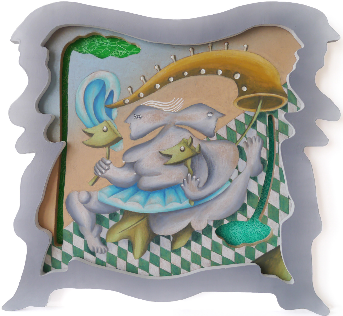
JADE CHING-YUK NG In a symphony of eyes wide open , 2021 Oil, Caran d'Ache, gouache, acetate on MDF wood 42x39x2 cm