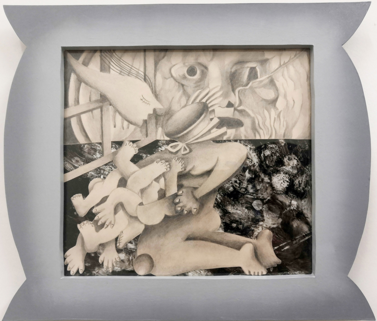
JADE CHING-YUK NG Peeping through myself, 2020 Graphite, oil, acetate on Rosaspina paper with artist made frame 44x38x2 cm