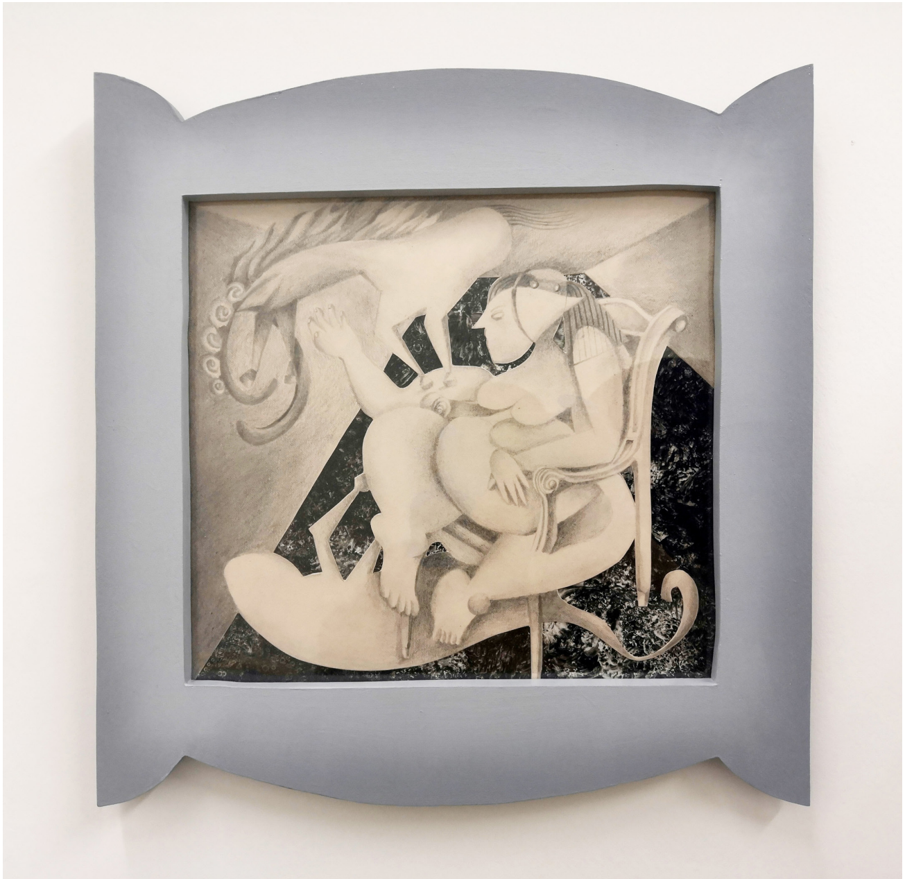
JADE CHING-YUK NG Flip , 2020 Graphite, oil, acetate on Rosaspina paper with artist made frame 40x41x2 cm