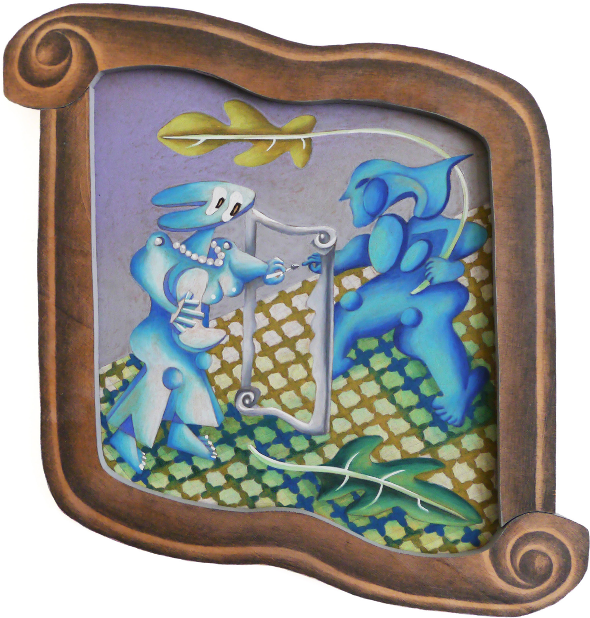
JADE CHING-YUK NG Drawing through the glass , 2021 Caran d'Ache, graphite, gouache and oil on MDF and plywood 39x40x2 cm